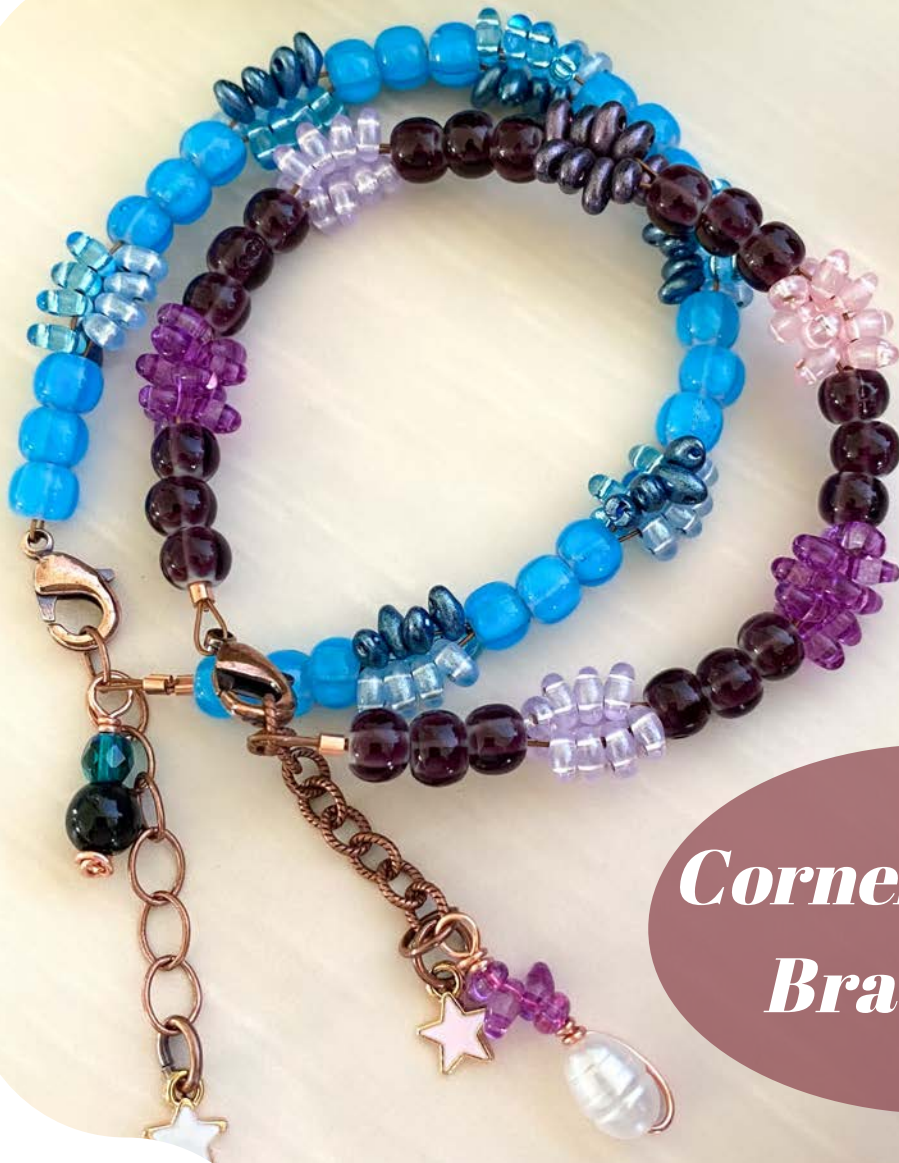
Cornelian Star Bracelets