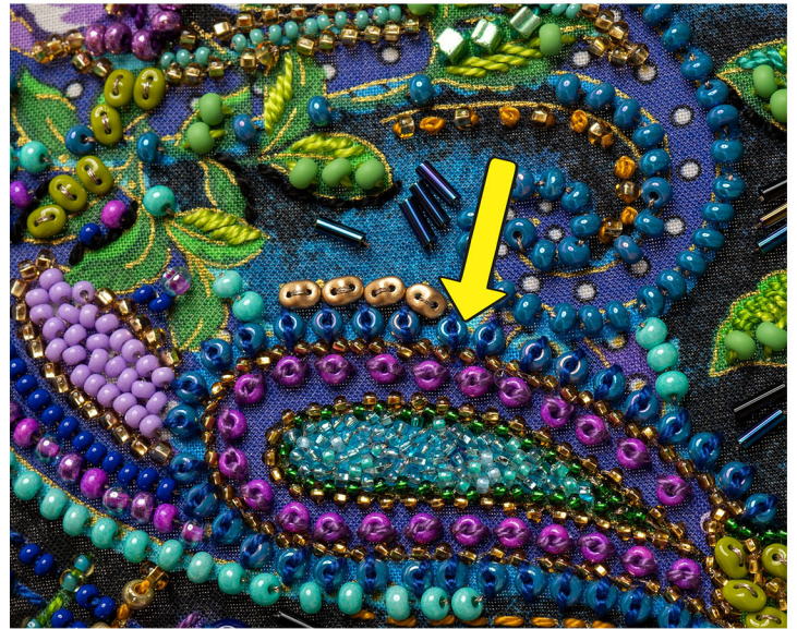
Depending on how you sew, beads can sit facing up or lay on their side.