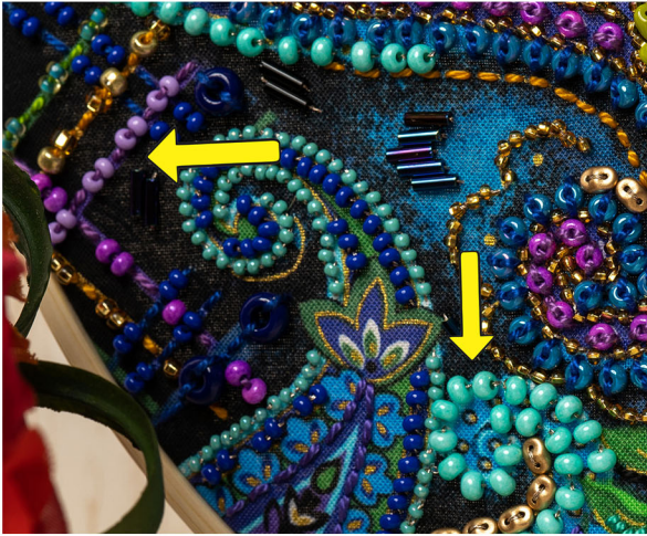
Beads can be sewn in straight lines or in curves to match the design on the fabric.