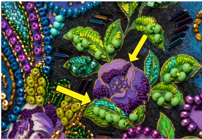
Embroidery thread next to beads adds to the design with extra color and texture.