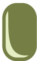
Size 11/0 Seed Bead, 695SB11O-4506V