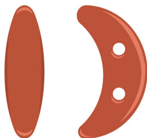
3 x 10 mm 2-Hole Crescent Beads Top and Side View

Czech Mate Crescent Beads can be used to create round and wavy shapes! Experiment with varying the size of beads strung in between. If you vary the size opposing in a pattern, you'll get waves, rounds, and half moon shapes that you can use to create designs. Here are a few examples to inspire. A square stitch method is used to stitch all ideas.