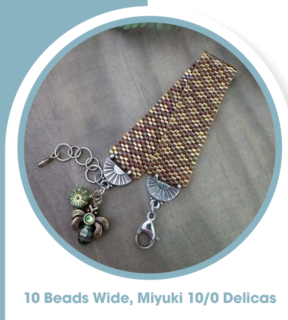
10 Beads Wide, Miyuki 10/0 Delicas

Using even-count peyote stitch, create a repeat of the following pattern to desired length. Be sure to leave a 10-inch tail to start, and finish with enough thread to sew on the finding. Refer to Page 2 for instructions to sew on the finding.