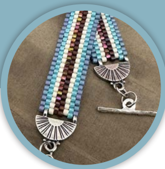
Miyuki 10/0 Delica