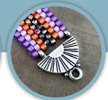
Matubo 10/0 Cylinder